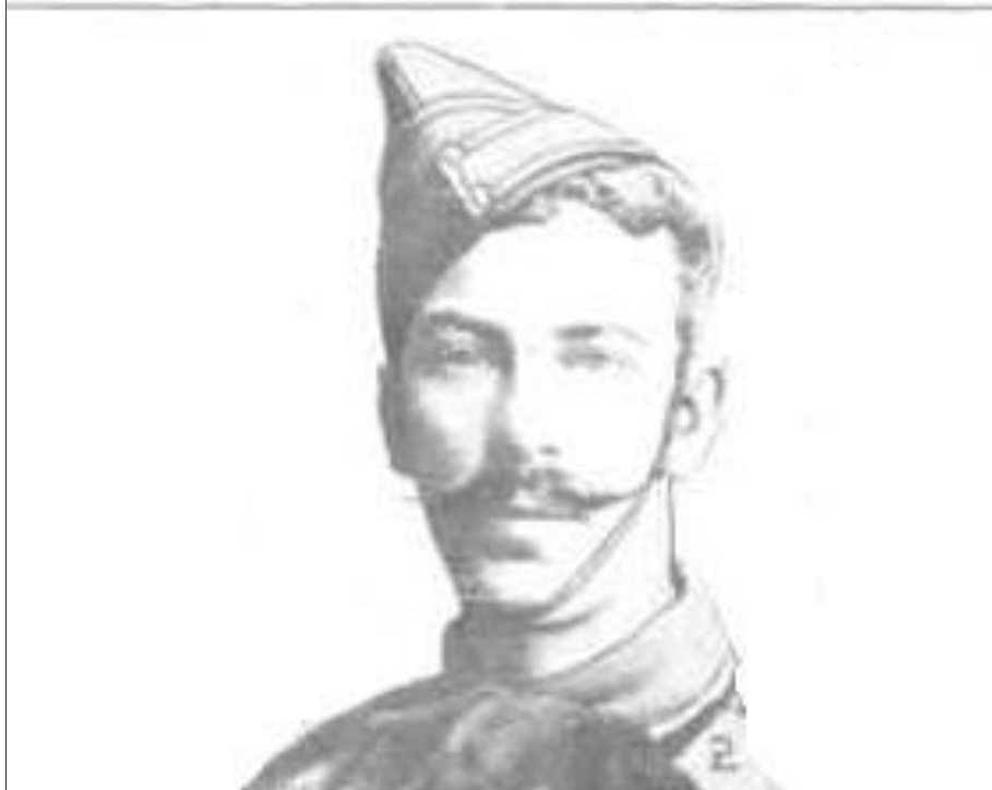
An image from "AUSTRALIAN SOLDIERS KILLED AT GALLIPOLI/THE DARDENELLES"