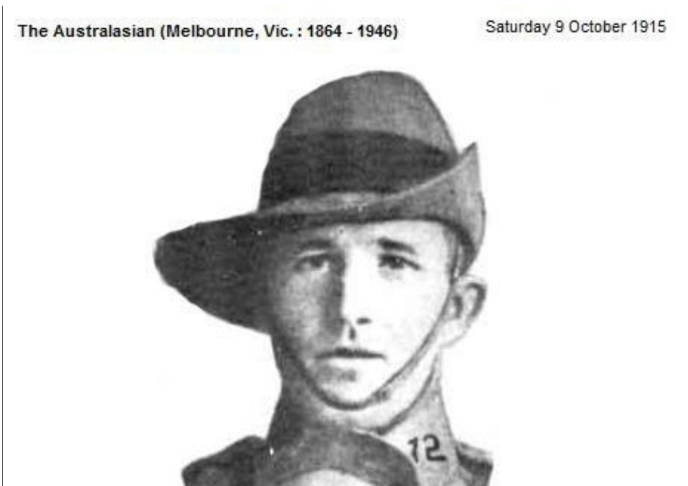
An image from "AUSTRALIAN SOLDIERS KILLED AT GALLIPOLI/THE DARDENELLES"