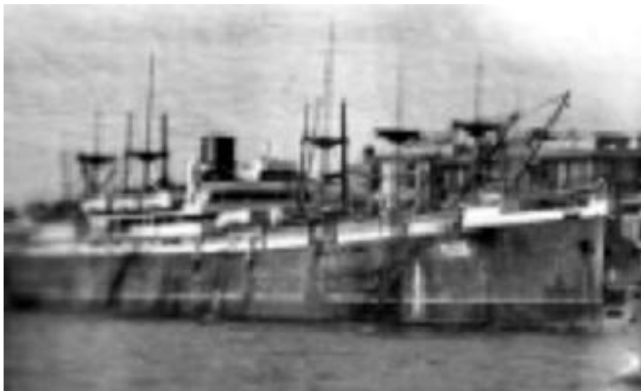
HMAT A38 Ulysses at Port Said, December 1914