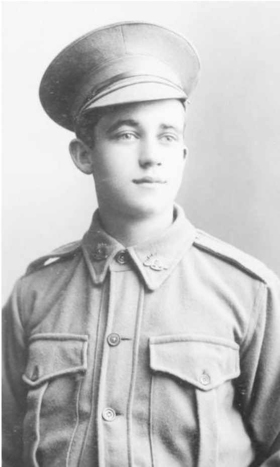
AUSTRALIAN WAR MEMORIAL