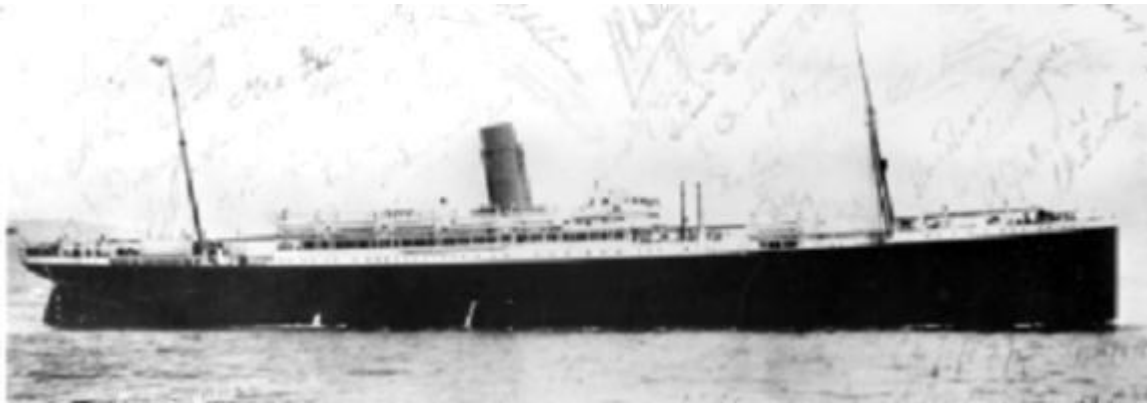
HMAT A14 Euripides , 1919