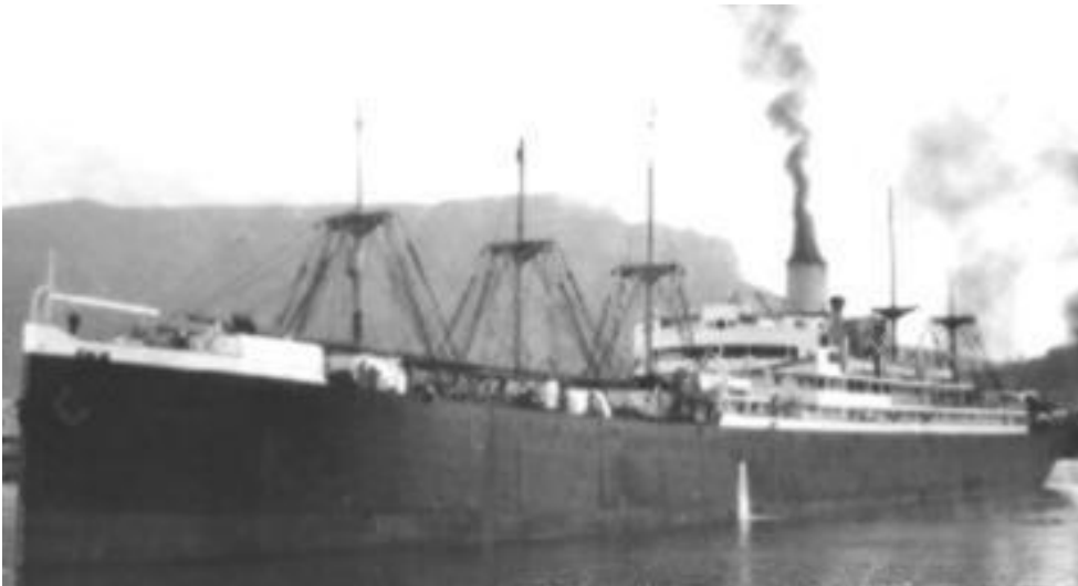
HMAT A8 Argyllshire