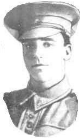
An image from "AUSTRALIAN SOLDIERS KILLED AT GALLIPOLI/THE DARDENELLES"