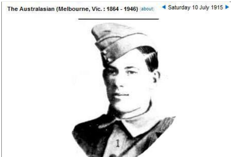
An image from "AUSTRALIAN SOLDIERS KILLED AT GALLIPOLI/THE DARDENELLES"

The Australasian (Melbourne, Vic. : 1864 - 1946) (about) ◀ Saturday 10 July 1915 ▶