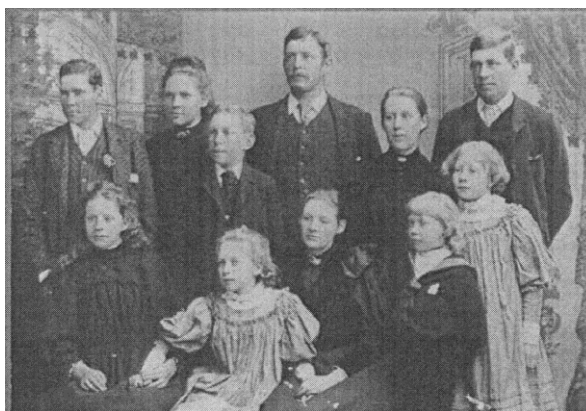
Eleven of the Priestley children, possibly No 3 (Arthur) to No 13 (Vivian).