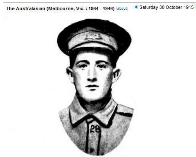
An image from "AUSTRALIAN SOLDIERS KILLED AT GALLIPOLI/THE DARDENELLES"