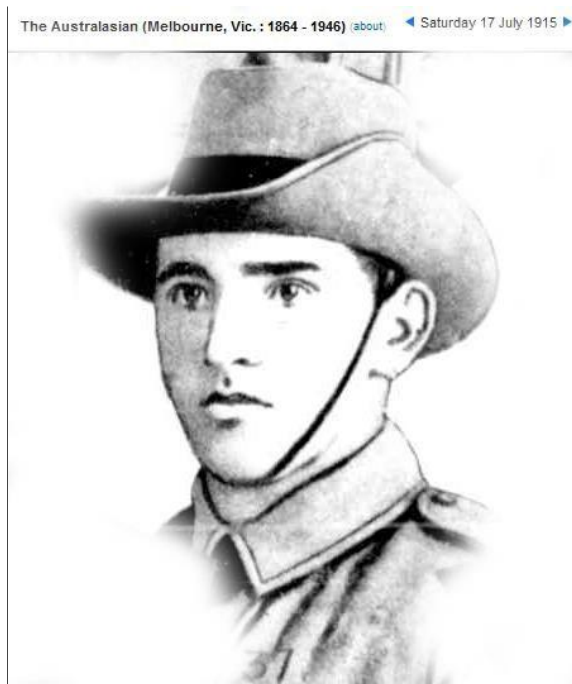
An image from "AUSTRALIAN SOLDIERS KILLED AT GALLIPOLI/THE DARDENELLES"