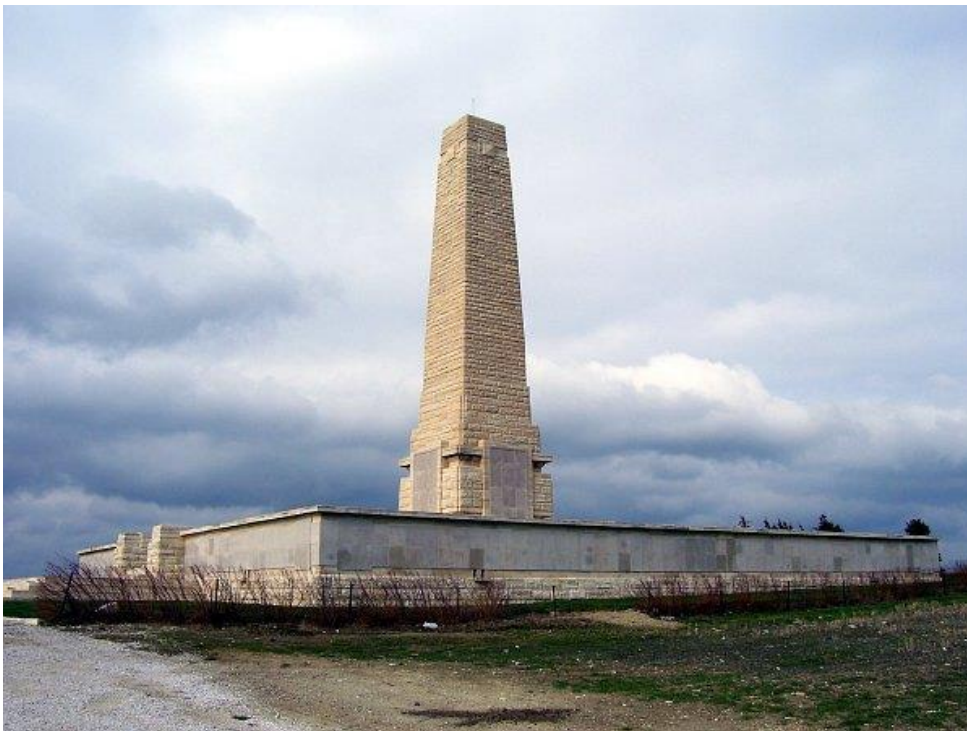
Cape Helles Memorial