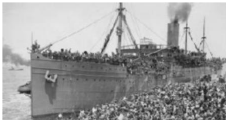
Transport A20 Hororata